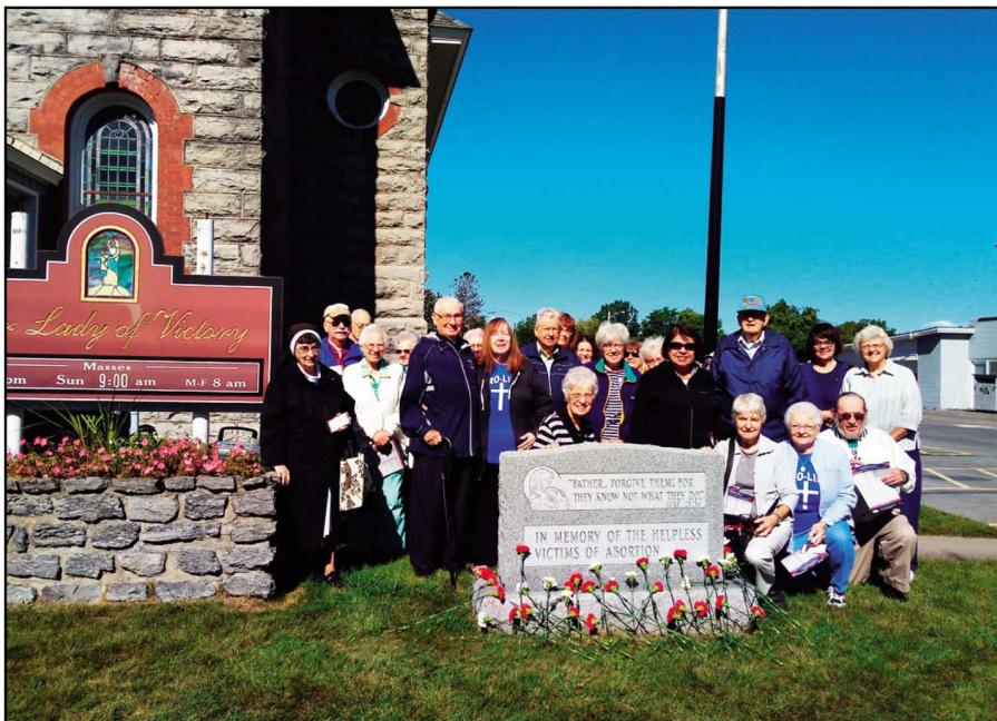
Members of our faith community gathered to remember children lost to abortion at the 6th annual national Day of Remembrance for aborted children held in Plattsburgh on Sept 8.